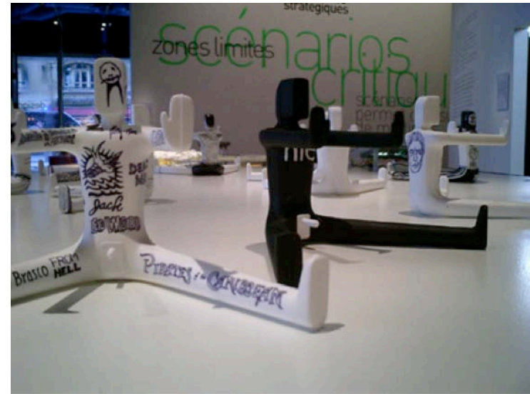
Figure 1: “Evidence Doll,” by Fina Raby. Commissioned for the D-Day exhibition, Pompidou Centre, 2005. (Image: http://architectradure.blogspot.com ).

An example of value-fiction is evident in the Dunne and Raby’s project ‘Evidence Dolls’ (2005) commissioned by Pompidou Centre in Paris (figure 1). On the hypothetical product of a plastic doll, young single women can save physical evidence from male lovers in order to extract DNA profiles at a later date. A group of women were asked to imagine how they might use the dolls, in order to foster a discussion of the impact of genetic technologies on social practice.