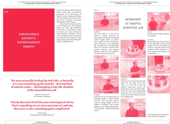
Figure 2: “Carnivorous Domestic Entertainment Robots,” in Material Beliefs , pp. 74-75, 2009 (Illustration with courtesy of the authors).

The Material Beliefs (see figure 2) project was from the outset conceived as a collaborative endeavour that aside from designers involved biomedical engineers, scientists, sociologists, and filmmakers, but also included school children and a large number of events directed towards the general public. The specific role assigned to the interaction between designers and design researchers in the project, was to act as mediators between specialists and non-specialists and to ‘open up a new space for communication’ (Beaver et. al 2009, viii). The position attributed to designers in the project, was based on the assertion the designers are in ‘a unique position because they are placed between science and the humanities’ (Ibid.). But simultaneously it was envisioned as a way to test what I have here described as the change from critical to speculative design: