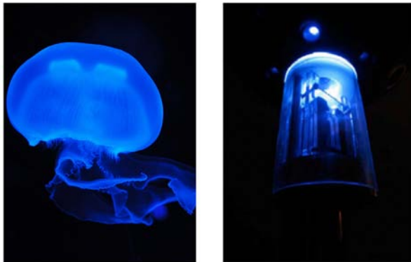
Figure 5: (left) Moon jellyfish (Foto: Petr Kratochvíl) – (right) “Lampshade robot,” one of the CDER robot prototypes (see figure 3), 2009 (Illustration with courtesy of the authors).

The aesthetic representations are highly adaptable to different situations and different kinds of public engagement. One of their strongest assets is that they are open for multiple interpretations due, in part, to their opaque and absurdist logic, but also because their aesthetic appearance (potentially) can reconfigure the sensible - both in terms of what we perceive and how we make sense of it (Rancière 2010).